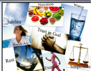
The 8 Laws of Health

2 - If we follow the health counsels in the word, they will give “health” to all our flesh.”